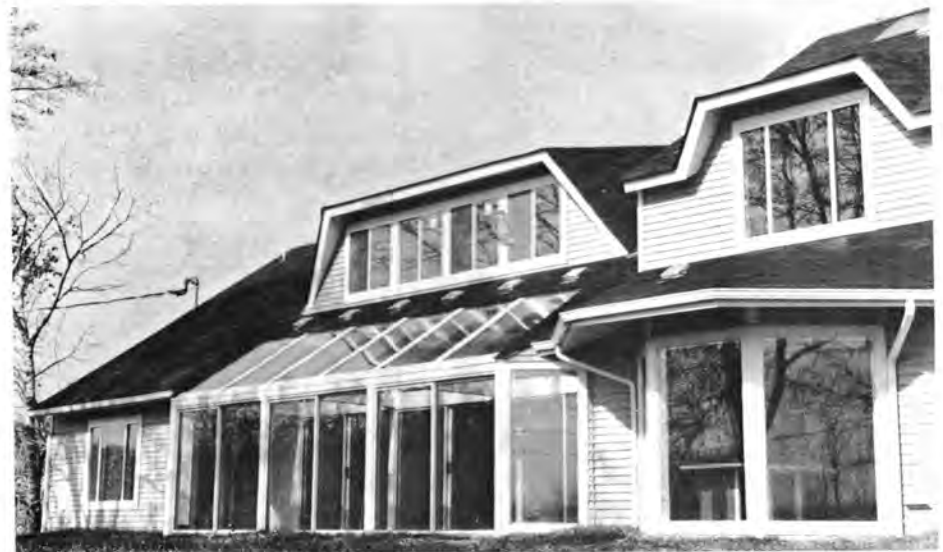
This beautiful solar home for adults is located in Bristol, Virginia. Funded through the Virginia Housing Development Agency, this home is a part of the Bristol Regional Rehabilitation Center which serves Tennessee and Virginia clients in the residential program.